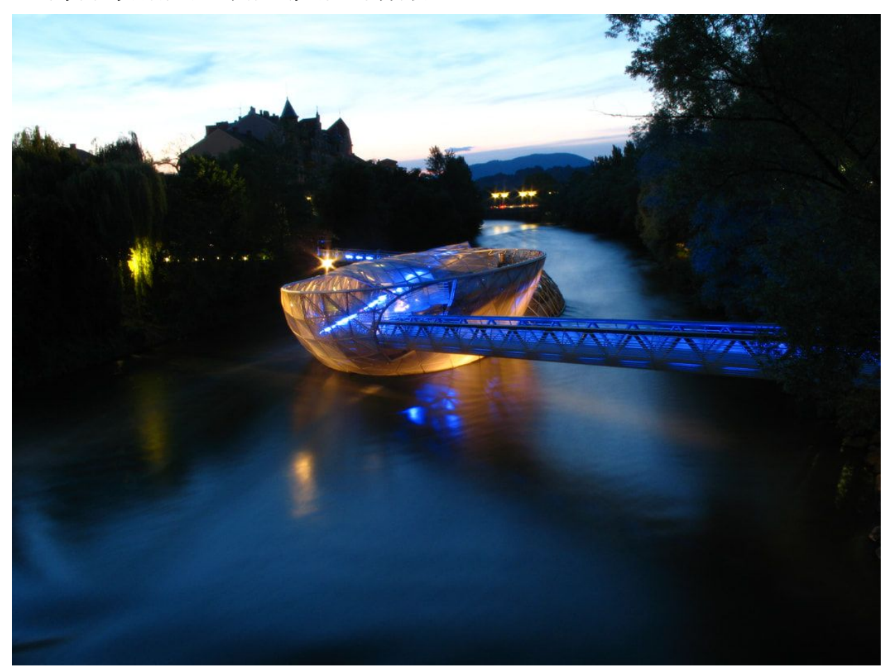
This was the structure I was talking about.

a good example because it shows how architects can be so creative and think and build something out of the ordinary. What I would do differently is put more lights so visitors who want to take pictures can see some of the inside better.